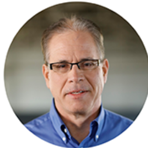
U.S. Senator Mike Braun