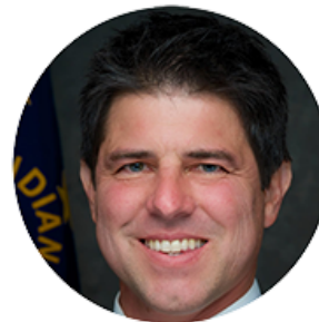
Senate Republicans President Pro Tempore Rodric Bray