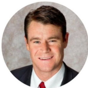
U.S. Senator Todd Young