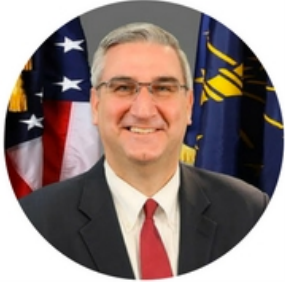
Governor Eric Holcomb