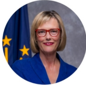
Lt. Governor Suzanne Crouch