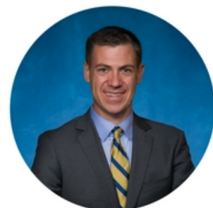
U.S. Representative IN-03 Jim Banks